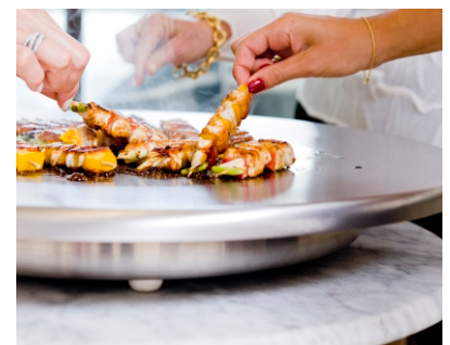
Shown accessories not included.

The manufacturer reserves the right to update, change, alter or discontinue any model without notice.