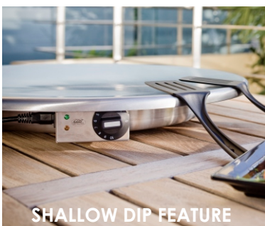
SHALLOW DIP FEATURE